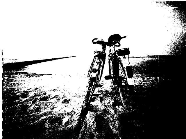
Above: explore the Maldives' Addu Atoll by bike from Villingili Resort. Below right: Lucknam Park Hotel near Bath has a new spa by Anne Sémonin.