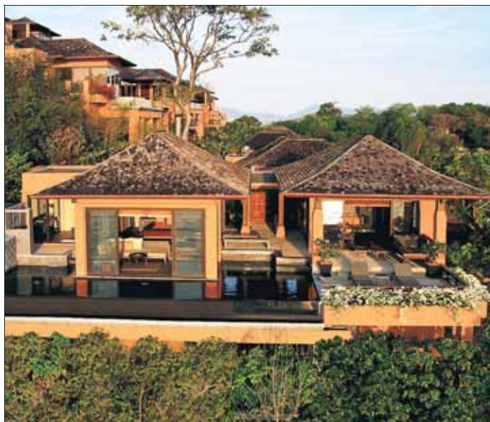
Realm of the senses ... (clockwise from above) Sri Panwa pool villas; Cool Spa has a long list of treatments; a pool villa bedroom.

There are tennis lessons with a former champ, a well-equipped gym, a cooking school and a luxurious new day spa. Dozens of day trips can be arranged from the resort's jetty (night fishing, diving, an island picnic, visiting the Phuket